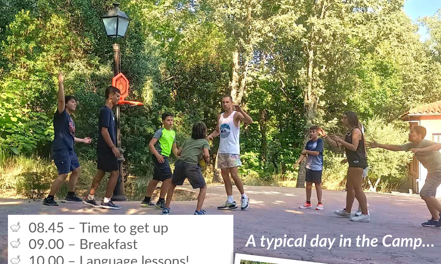
A typical day in the Camp...